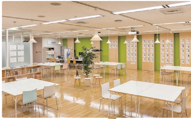
Easily accessible via the train station A bright and spacious consultation space